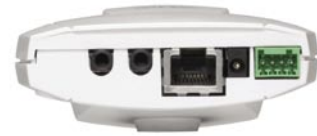
AXIS 210A Network Camera