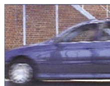
Interlaced, 20 ms difference between odd and even lines