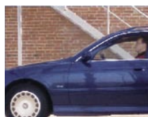
Progressive Scan, all lines are captured at the same time

Progressive scan is used instead of the interlaced method found in analog CCTV (PAL/NTSC) cameras. With progressive scan all pixels (lines) are captured at the same time, enabling moving images to be presented without distortion.